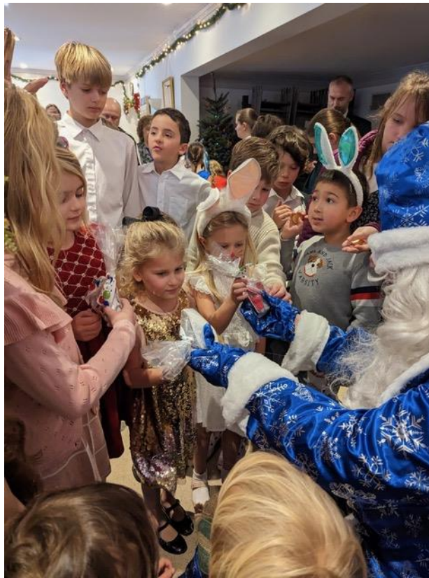
Вот и еще.....and some more.....