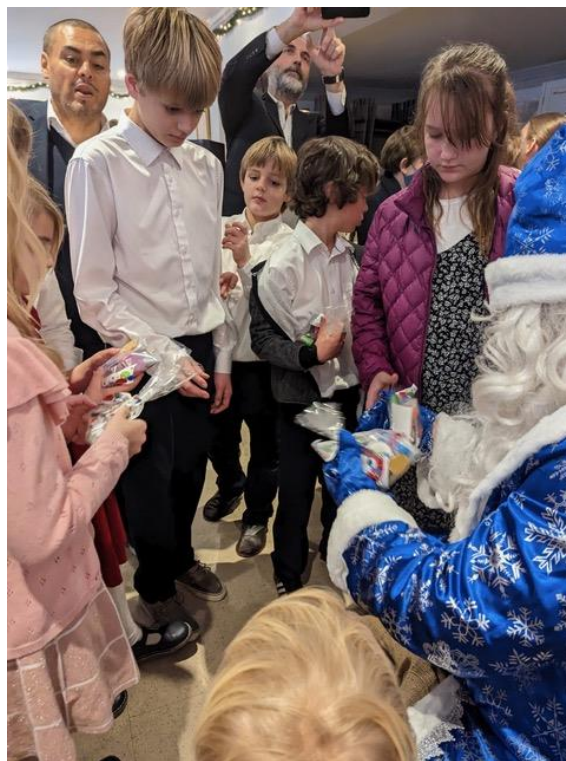
Детишки получают мешочки с лакомством от Деда Морозо Children receive goodies bags from Ded Moroz