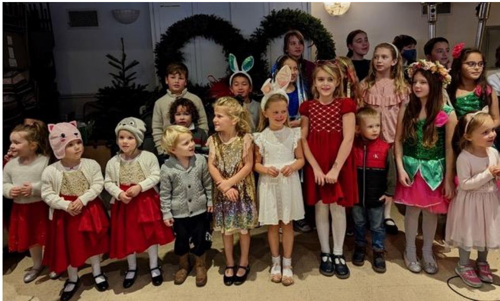
Школьная семья--братья и сестрички.....Our School family—brothers and sisters